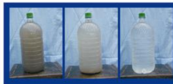
Contaminated Water 12-hours later 24-hours later